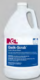
Qwik-Scrub™ Scrub & Recoat Cleaner