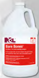
Bare Bones® No-Rinse / No-Scrub Liquifying Stripper