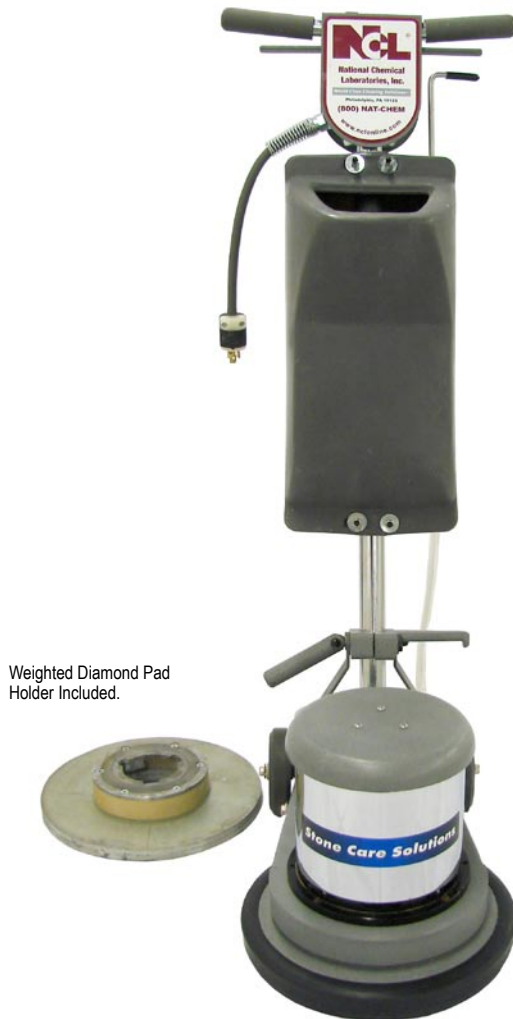
Weighted Diamond Pad Holder Included.